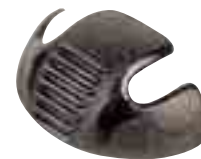
SF517 Toe Protector