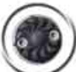
SF519 STREET CAP Summer