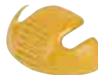
SF516 Toe Protector