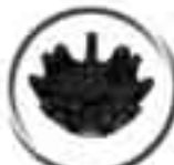
SF520 SCORPION Grass & Snow