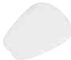
SF514 Felt Tongue Pad