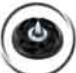
SF521 ICE GRIPPER Forestry & Ice