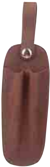
SF505 Pencil & Knife Holder