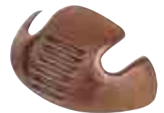
SF518 Toe Protector