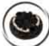
SF522 ICE GRAB Ice & Snow